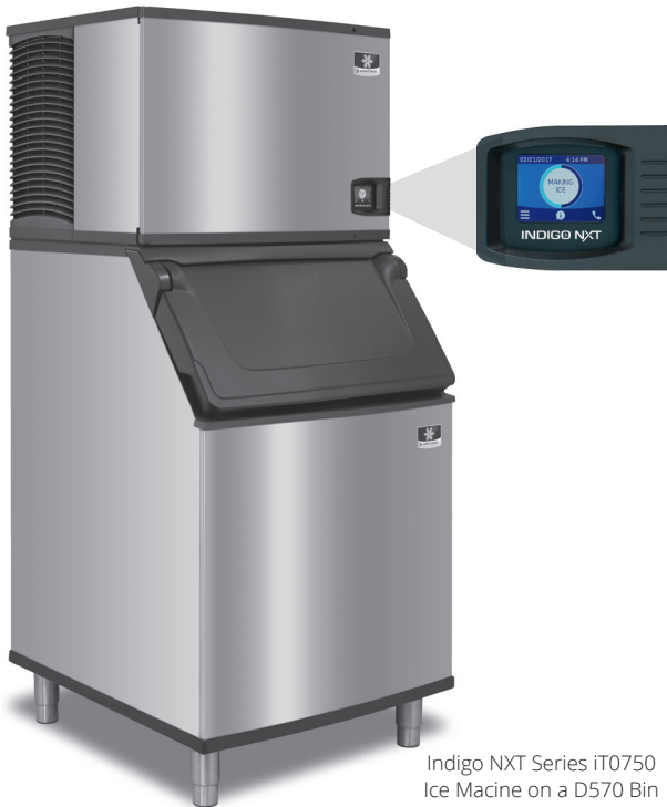
Indigo NXT Series iT0750 Ice Machine on a D570 Bin

Designed for operators who know that ice is critical to their business, the Indigo@NXT Series ice machine's preventative diagnostics continually monitor itself for reliable ice production. Improvements in cleanability and programmability make your ice machine easy to own and less expensive to operate.